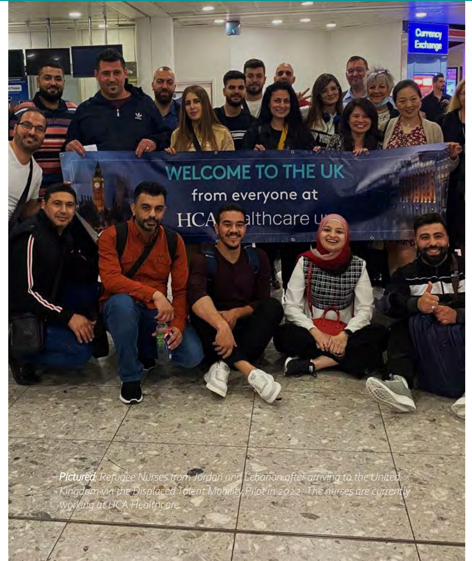
Pictured: Refugee Nurses from Jordan and Lebanon after arriving to the United Kingdom via the Displaced Talent Mobility Pilot in 2022. The nurses are currently working at HCA Healthcare.