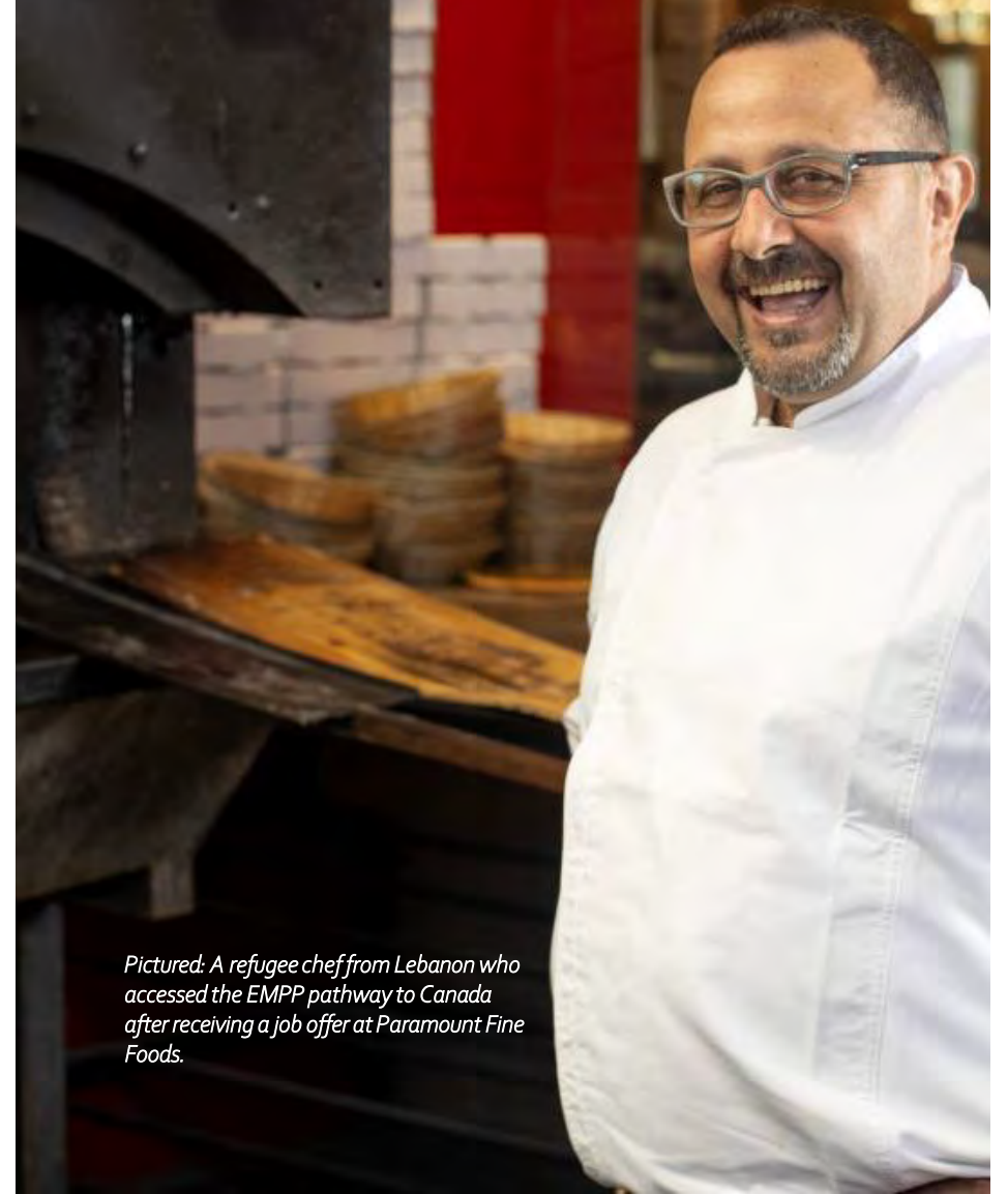
Pictured: A refugee chef from Lebanon who accessed the EMPP pathway to Canada after receiving a job offer at Paramount Fine Foods.